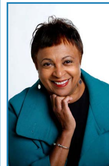
Dr. Carla Hayden

The closing address was delivered by Dr. Carla Hayden, the 14th Librarian of Congress. Conference-goers cheered and celebrated the fact that Dr. Hayden embodies three firsts in her new role: the first African American; the first woman; and the first librarian. Speaking as a librarian to librarians, Dr.